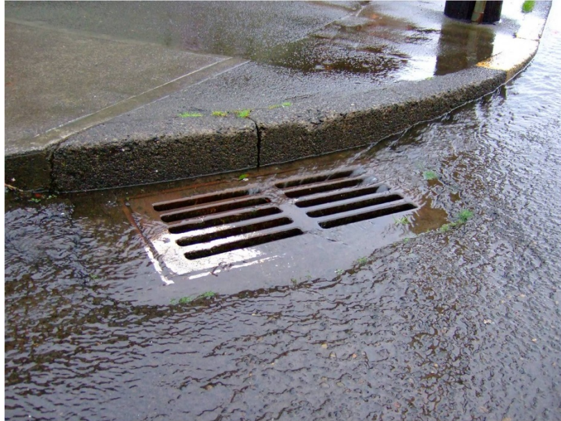
Public storm water drain